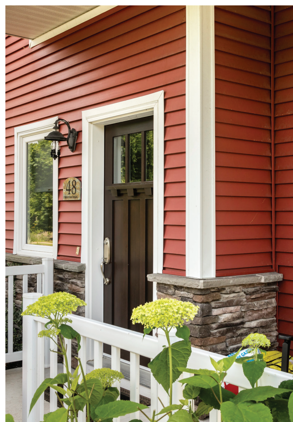
Estate™ D4 in Redwood, Royal® Vinyl Trim in White

PVC resin is the backbone of our vinyl siding, and begins with two abundant building blocks: chlorine from common salt and ethylene from natural gas. The PVC resin is optimized with a range of other proprietary ingredients to provide a reliable exterior product that can be formed into a range of shapes, and last a lifetime.